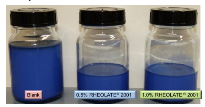
Figure 1: Stability of aqueous ink

Further, RHEOLATE<sup>®</sup> 2001 does neither affect the gloss, the film build nor the levelling character of the final system.